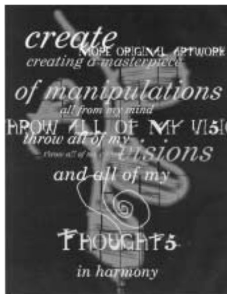
Figure 13 Student work.