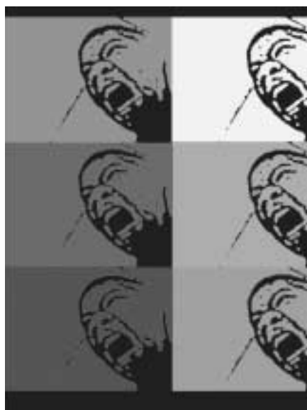
Figure 12 Student work.

The Filters menu bar offers many options for applying special effects such as distortion, pixelization, and stylizing.